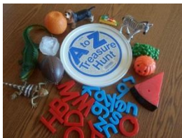
A to Z Treasure Hunt