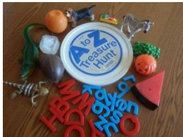
A to Z Treasure Hunt