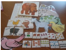
Literacy Kit: Brown Bear, Brown Bear, What do you See?

Kit Includes book and story sequencing cards.