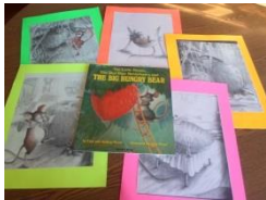
Literacy Kit: The Hungry Bear, the Tiny Mouse, and the Big, Red, Ripe Strawberry

Kit Includes: book "Planting A Rainbow", book "Susie Plants a Seed", watering can, 4 flower cups, rake, shovel, bag of seeds, and flower patter matching game.