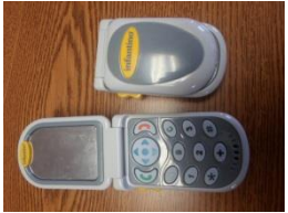
Bilingual Cell Phones

Cell phones that speak in English and Spanish.