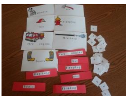
Fireman's Matching Letter Game

26 Carpet squares with each letter of the alphabet for children to play games with or to sit on.