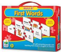
Foreign Word Match: First Words

Cell phones that speak in English and Spanish.