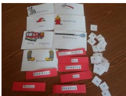
Fireman's Matching Letter Game

26 Carpet squares with each letter of the alphabet for children to play games with or to sit on.