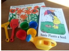
Literacy Kit: Planting A Rainbow

Kit Includes: book "Planting A Rainbow", book "Susie Plants a Seed", watering can, 4 flower cups, rake, shovel, bag of seeds, and flower patter matching game.