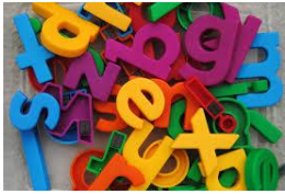
ABC and Number Magnets