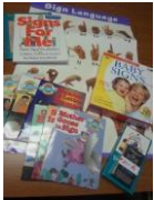
Sign Language Kit

3 piece puzzles with English word, picture, and Spanish word.