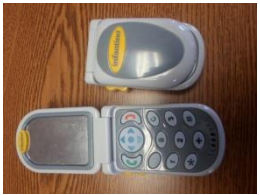
Bilingual Cell Phones

Cell phones that speak in English and Spanish.