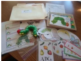
Literacy Kit: The Hungry Caterpillar

Kit Includes: Book, puzzle matching cards, counting cards #1-10, flannel board pieces, and brown bear animal graphing chart.